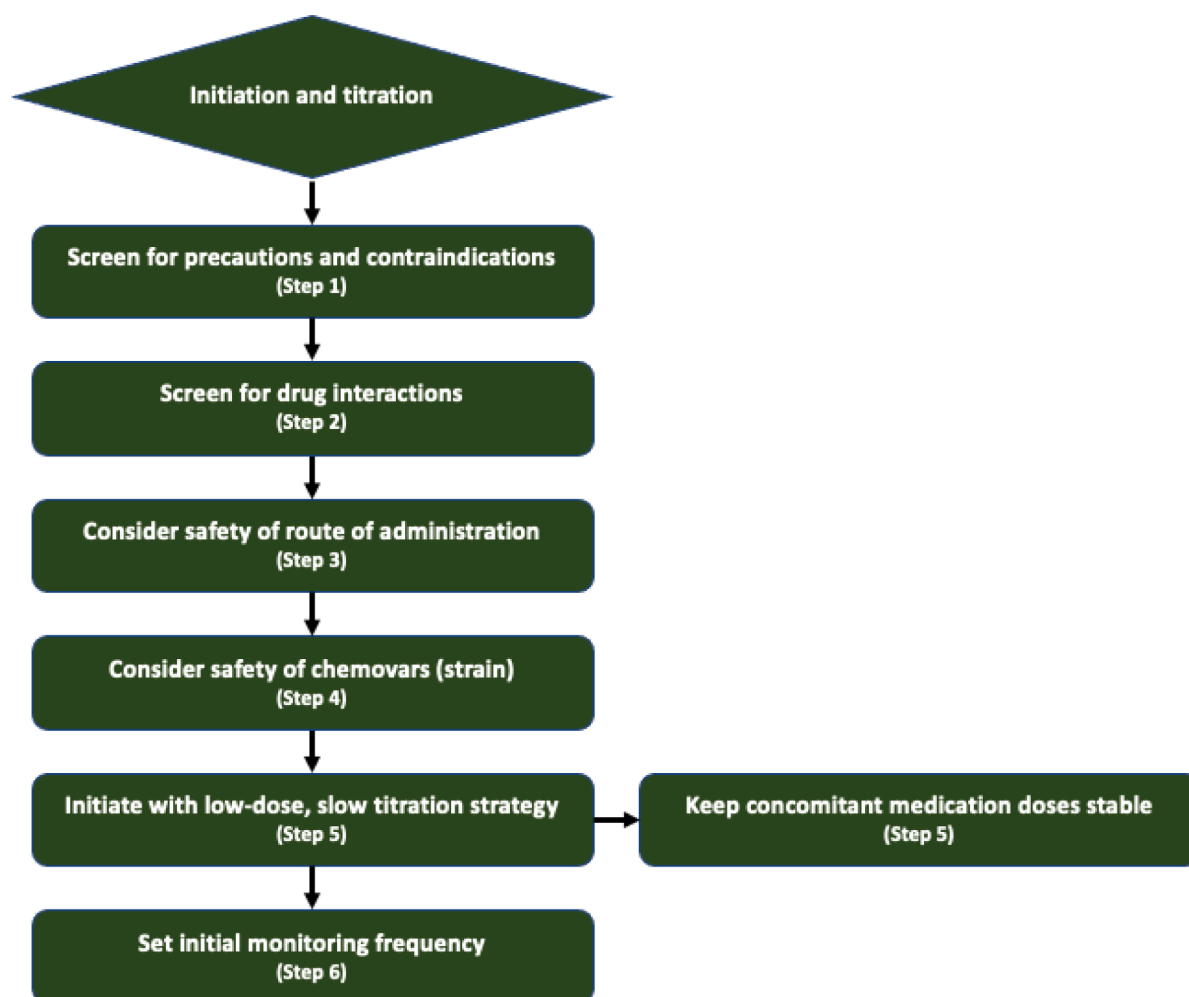
Fig. 1. Key considerations when initiating and titrating medical cannabis.

Chronic kidney disease. Cannabinoids are thought to be safe in patients with chronic kidney disease (CKD), including end stage renal disease; monitoring of renal function may be helpful [51,52]. Clinicians should recommend using the lowest effective dose, and abstaining from illicit